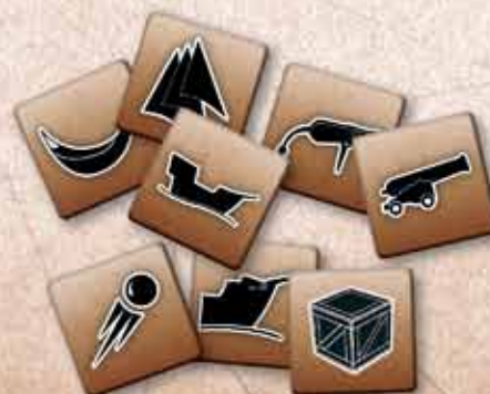
Ship Modification Tokens