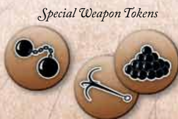
Special Weapon Tokens