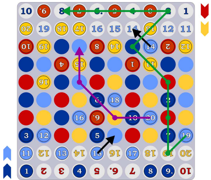
Beginning midgame situation, blue's turn. Sample moves:

Note: Here it is not mandatory to land on the according colour after the STEP, since the move has not yet ended.