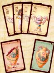
Lucia's amphora Peter's amphora

Following the previous example, now Peter is playing, and he does not trust his opponents, so he decides to reveal all the cards in play. There are 3 mummies in total, which is one less than indicated. Therefore, Peter was right to distrust and gets a new amphora. Lucy receives a broken amphora and Dani, even though he was the one who lied, gets no amphora because Lucy trusted him.