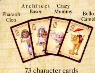
73 character cards