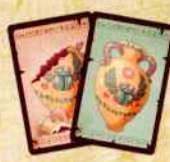
18 amphora cards