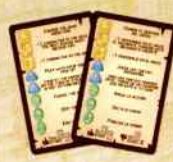
4 help cards