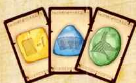
15 action cards